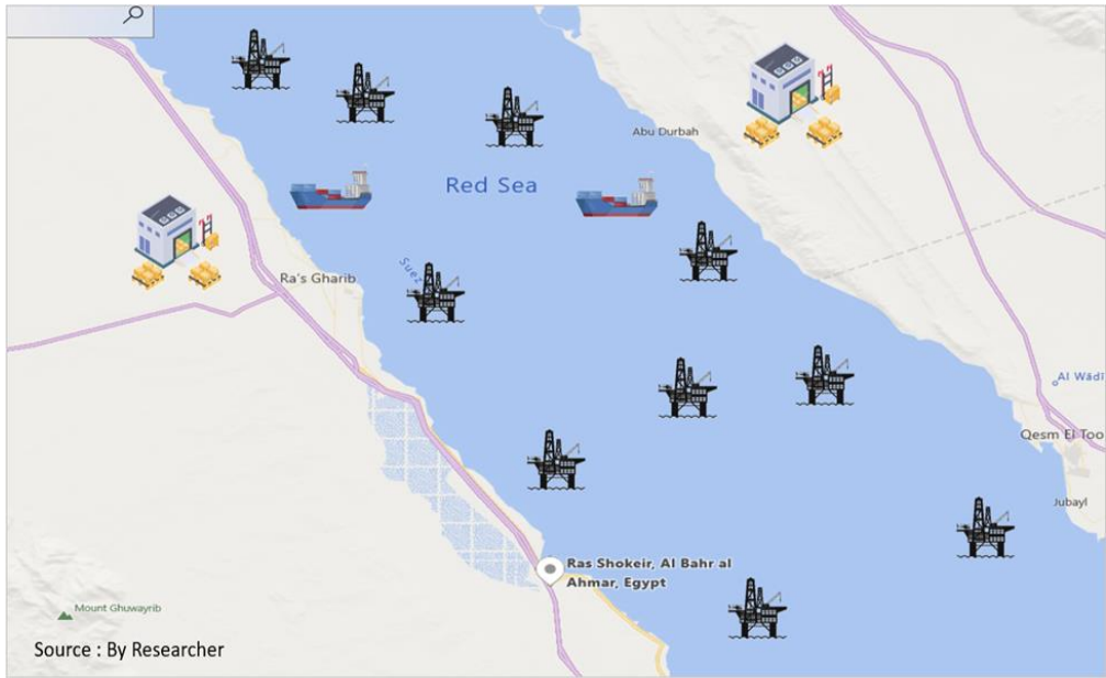
Figure 1 problem description

A mathematical model was developed to optimize fleet composition for offshore supply operations. A Genetic Algorithm is applied using software package, Evolutionary Solver in Excel 2019 to find the best combination of fleet composition for offshore supply operations. Figure 1 refers to the problem addressed in this study is to determine the optimal fleet composition for offshore supply operations, with the objective of minimizing costs while ensuring secure and dependable supply chains. The problem involves a tactical and operational planning horizon, divided into hours, with a fixed number of offshore installations, a variable number of platform supply vessels (PSVs), and two onshore bases. The demands are categorized as planned and unplanned, and they are transported using PSVs for planned normal demand only, while helicopter transport and unplanned demands are excluded from the model. The capacity of both PSVs and offshore installations is limited. The PSVs sail various routes to visit offshore facilities, and the routing of PSVs must be determined, considering